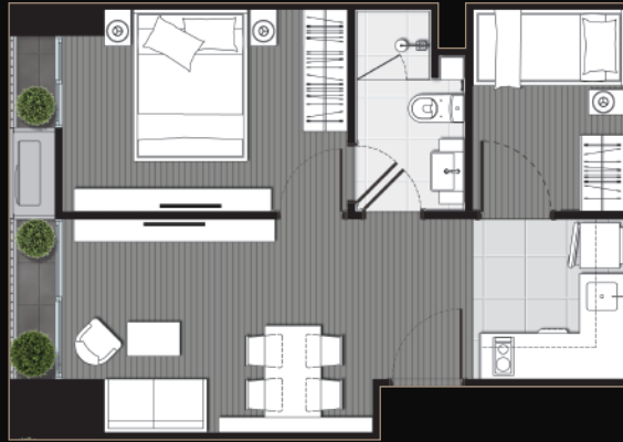
1-BED PLUS : 41.56 - 44.89 sq.m.