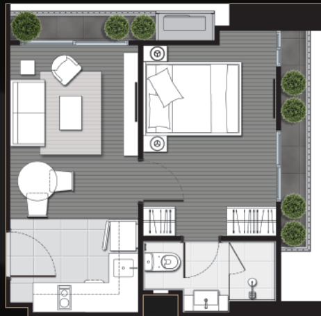
1-BED M : 34.78 - 35.16 sq.m.