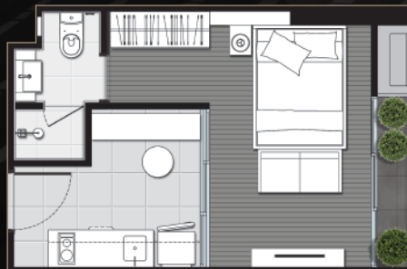
1-BED S : 26.40-27.30 sq.m.