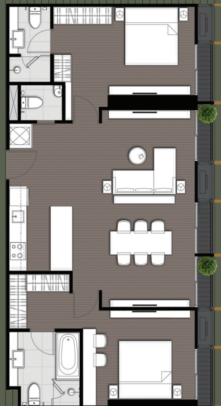
PENTHOUSE (72.68 - 105.97 sq.m.)