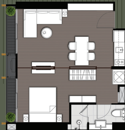
1-BED L (42.55 sq.m.)