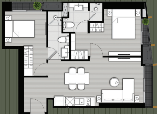
2-BED (58.45 sq.m.)