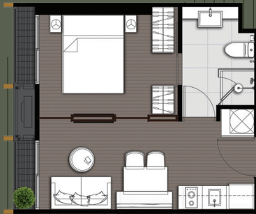
1-BED S (29.81 sq.m.)